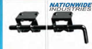
36" DROP ROD KIT