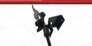
U HINGE 2.5"X4"