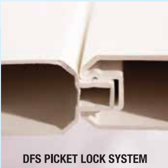
DFS PICKET LOCK SYSTEM