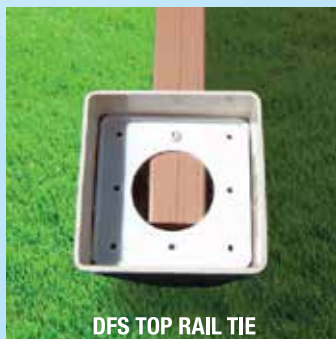
DFS TOP RAIL TIE