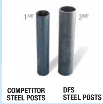
COMPETITOR STEEL POSTS