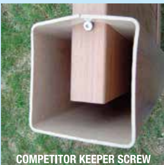
COMPETITOR KEEPER SCREW