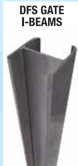
DFS GATE I-BEAMS