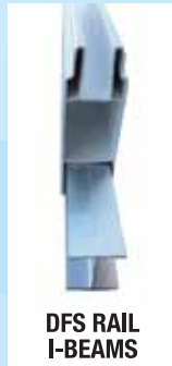
DFS RAIL I-BEAMS