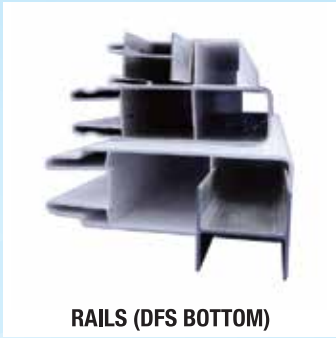
RAILS (DFS BOTTOM)